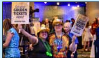
Residents from our Two Sparrows Village helped sell Golden Tickets and had fun giving light up stars to purchasers.