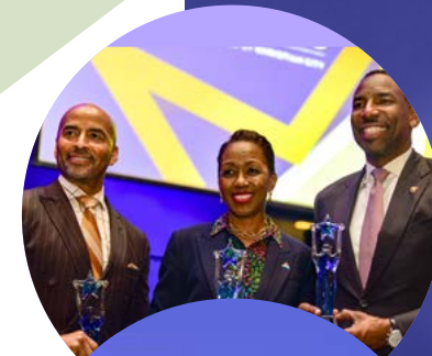
2025 Individual – Mayor Andre Dickens Nonprofit – Goodwill of North Georgia Corporate – Georgia Power