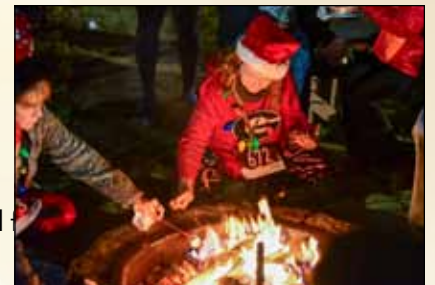
Everyone stayed toasty warm around the S'mores fire pit.

Thanks to our sponsors and run participants, we were able to raise close to $60,000 to benefit the Christian City Children & Family Programs. These funds are so important to continue our mission of serving those children who are struggling through no fault of their own. Our programs continue to lift children and up and help break cycles of poverty, neglect and abuse.