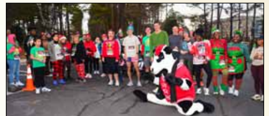
The Chick-fil-A cow kept the crowd entertained and got the participants ready for the run.