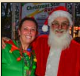
Of course, Santa brought holiday cheer and lots of smiles to the guests.