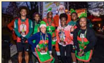
Members of the South Fulton Running Club were decked out in fun holiday apparel and having a ball.